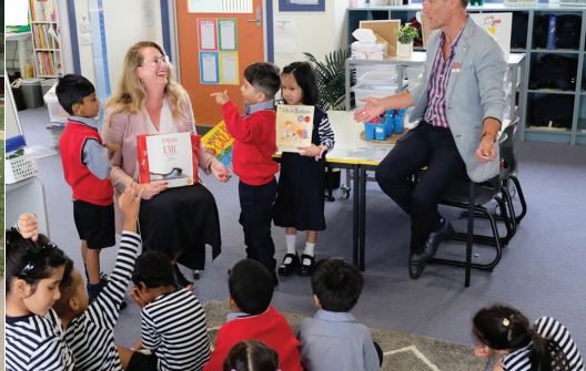
$11.23 Million (2019)