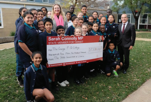
$9.5 Million (2018)